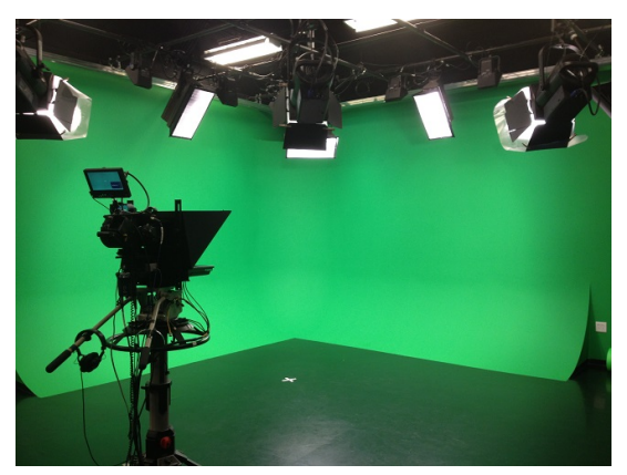
Goodyear Studio, Eaton High School

The evolution of television from the electronic transmission of pictures into a mass communications and artistic medium required the development of an entirely new lighting design art form. Although derived from the basic principles of still photography, the fundamentals of television lighting have evolved into a much more dynamic form to meet the needs of this uniquely demanding medium. The original requirement of providing enough light on the subject to produce a picture of transmission quality has progressed from the black and white "snows of times past" into a new age of technical excellence. In fact, television has become an artistic medium as much through the development and proper application of appropriate lighting fixtures and control systems as through camera improvements. Now, improved media formats including 4K and HD are increasing the need for superior lighting.