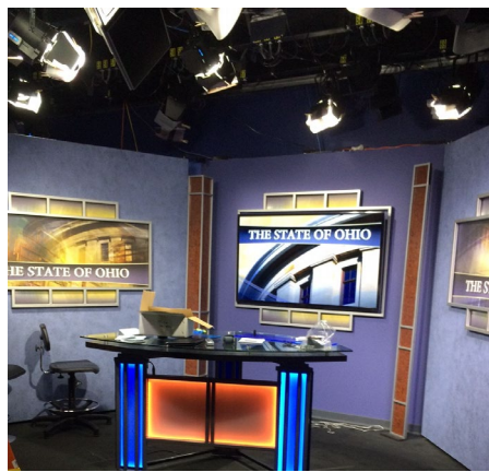
Ohio Channel Studio

Base lights establish the overall light level on the studio set. The scoop or floodlight is the most commonly used fixture for base lighting. A large wattage unit which is relatively uncontrollable in terms of focus, the base light must produce a soft edged field of light so that multiple units can be easily blended. Base lights may also be used to provide a color mixture on the set, if required. Ideally, base lights should have an adjustable focus mechanism to provide some measure of beam spread control.