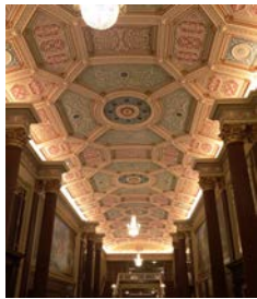
Playhouse Square – Ohio Theatre Lobby

Downlights represent the majority of the perceived light in any environment. Aiding navigation of the space, these fixtures constitute units such as recessed can lighting, hanging pendants and direct mounted lighted fixtures. The ability to control the intensity and color temperature of these fixtures can greatly enhance their purpose and utility.