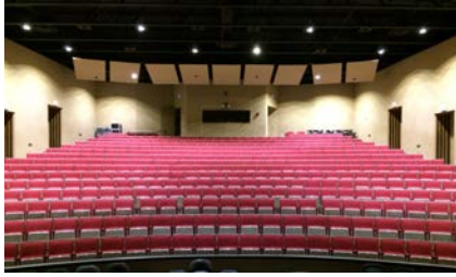
Miami University – Parrish Auditorium